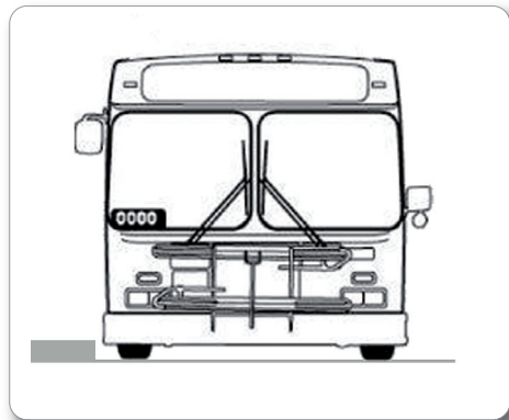
Front view of bus