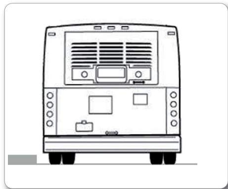
Back view of bus

Write down why you think there is a danger: